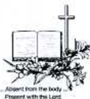
... Absent from the body ... Present with the Lord