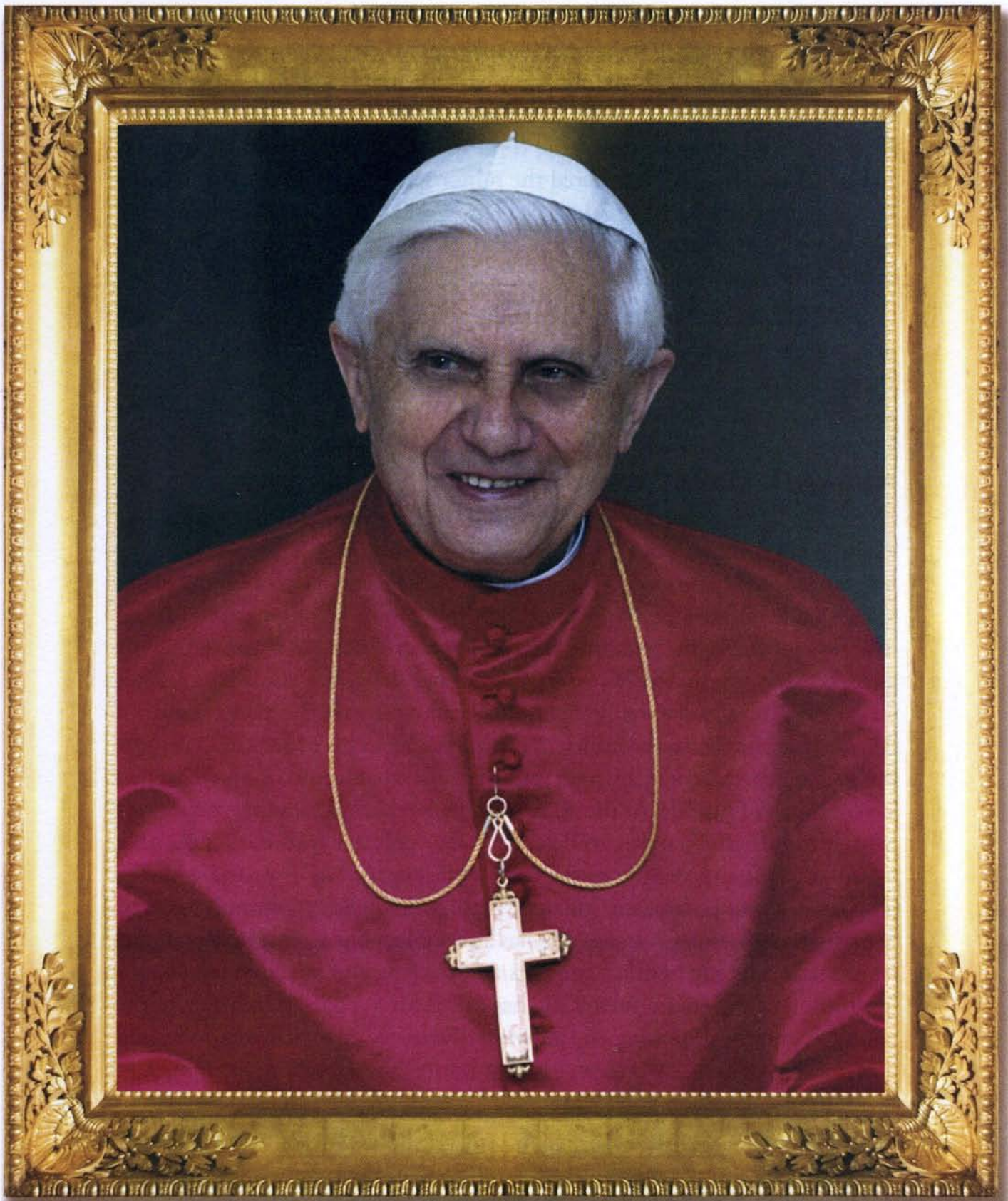
In Gratitude for Faithful Leadership in Service of the Gospel April 19, 2005 – February 28, 2013